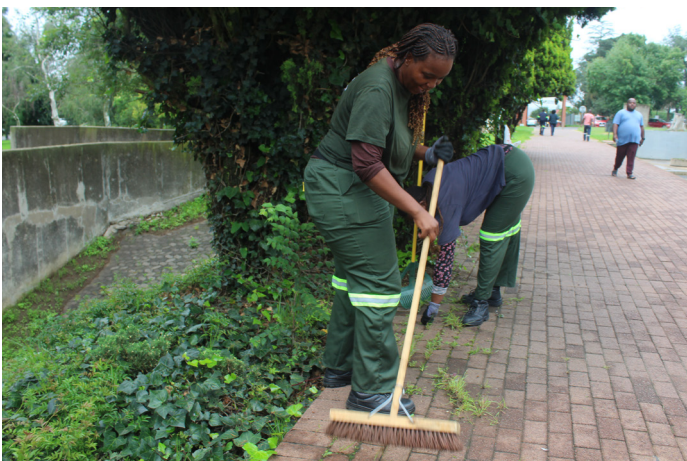
THESE RECRUITS STATIONED UNDER SPORTS, PARKS AND CEMETARY SECTION DOING ROUTINE MAINTANANCE AT THE CIVIC CENTRE.