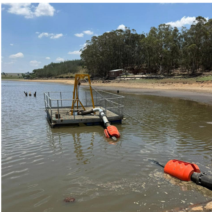
TORBANITE DAM IN DECEMBER 2024 WHILE THE WATER LEVEL WAS CRITICALLY LOW.

Prolonged periods of drought significantly reduced water levels in our municipality's reservoirs and dams