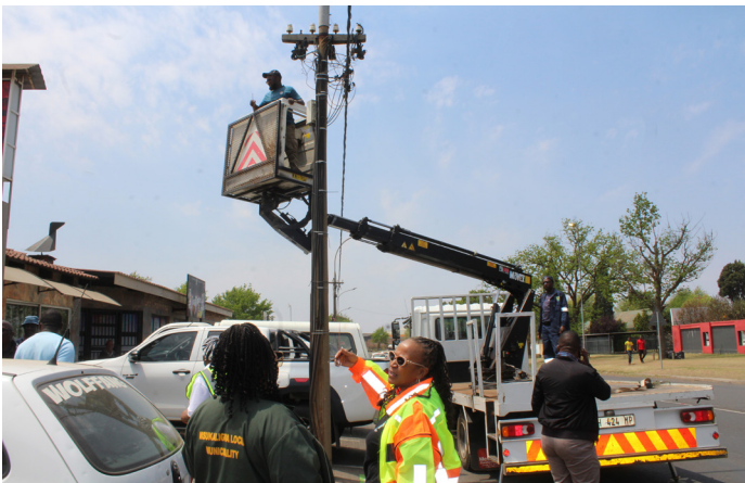
THE ELECTRICAL SERVICES TEAM ALSO ENLISTED THE USE OF A CHERRY PICKER TO CUT SUPPLY FROM THE ELECTRICITY DISTRIBUTION POLE TO PREVENT TAMPER.