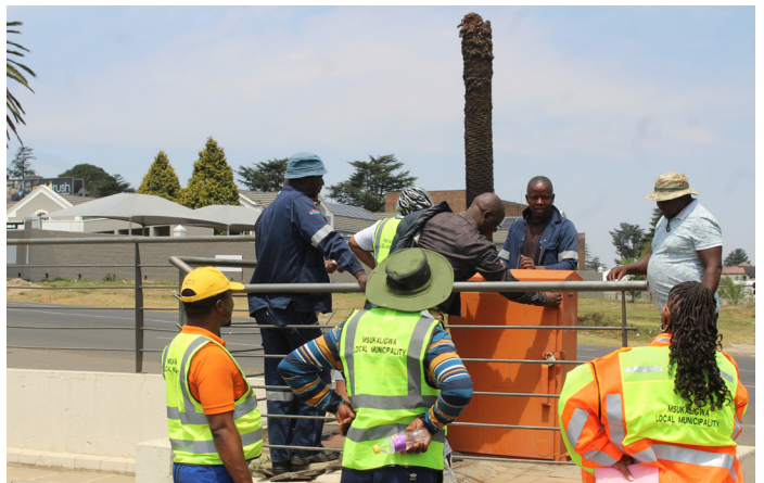
THE OPERATION ALSO EXTENDED TO TAUTE STREET.