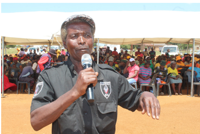
A COMMUNITY MEMBER OF WARBURTON INTERACTING WITH LOCAL GOVERNMENT OFFICIALS.