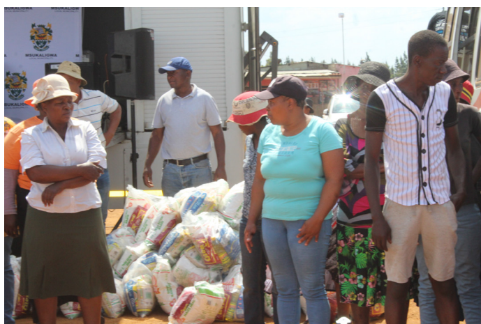
COMMUNITY MEMBERS DURING THE HANDOVER OF FOOD PARCELS