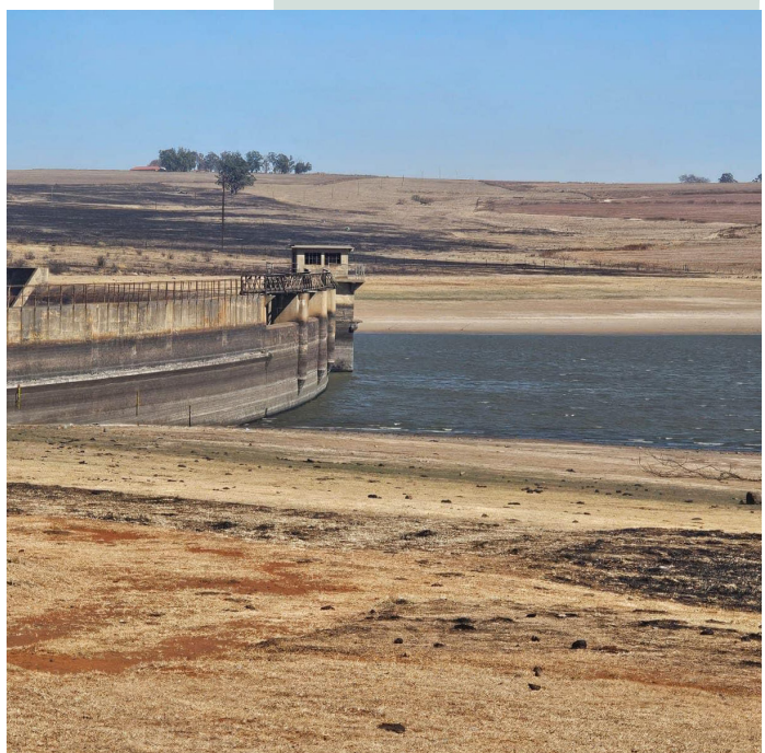
BRUMMER DAM AT 10% WATER LEVEL.