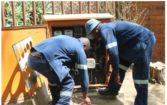
ELECTRICAL SERVICES TEAM WHILE THEY WORKED DILIGENTLY TO DISCONNECT ELECTRICITY SUPPLY TO NON-COMPLIANT BUSINESSES.