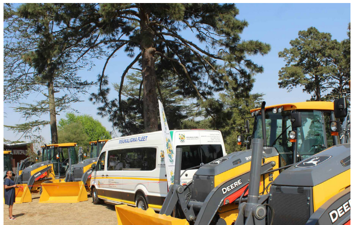
THE 22 SEATER MINIBUS FOR SERVICE DELIVERY AND THE FIVE (5) TLBS FOR THE FIVE(5) SELECTED TOWNS WITHIN MSUKALIGWA.