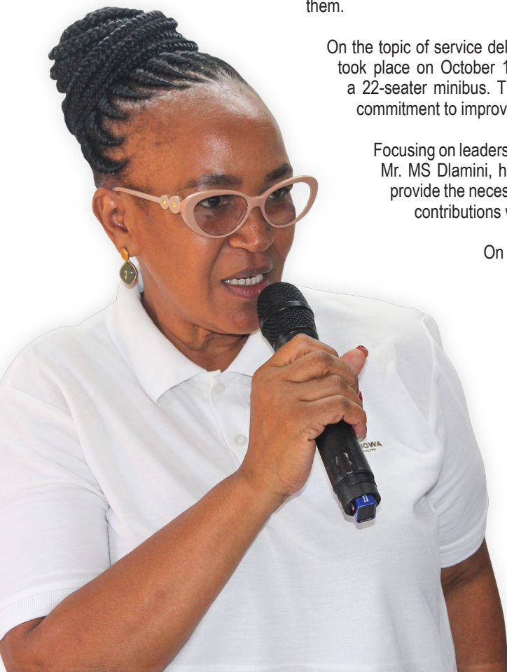
ALDERWOMAN MP NKOSI EXECUTIVE MAYOR

The oversight visit underscored the municipality's commitment to transparent governance and the delivery of essential services to its residents.