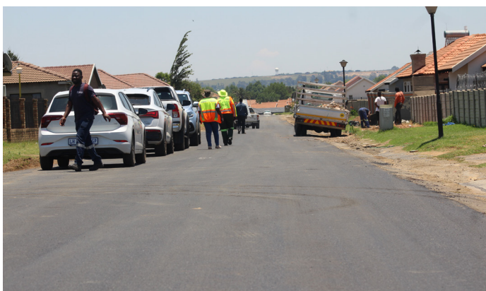
THE REHABILITATED 0.56 KM ROAD IN ERMERLO, WARD 8.