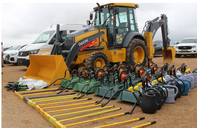
THE BRANDED 22 SEATER MINIBUS, THE TLB DESIGNATED TO WARD 15 AS WELL AS FARMING EQUIPMENT DONATED IN SUPPORT OF LOCAL AGRICULTURE.