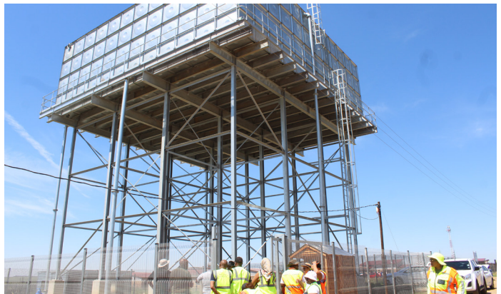
THE NEWLY INSTALLED ELEVATED STEEL TANK IN WARD 16.

The oversight visit underscored the municipality's commitment to transparent governance and the delivery of essential services to its residents. While significant progress has been made on the water supply and road rehabilitation projects, the delay in the Mabuza Bridge reconstruction highlights the challenges faced in large-scale infrastructure development. Msukaligwa Local Municipality remains committed to addressing these challenges and ensuring that all projects are completed to benefit the community. Further updates will be provided as new developments arise.