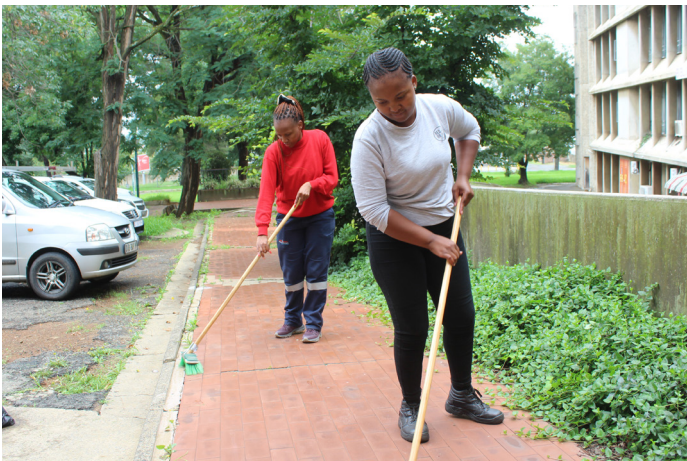
OFFICE BASED NEW RECRUITS WHILE THEY PERFORM THEIR DUTIES AT THE CIVIC CENTER.

This recruitment drive under the EPWP is a reflection of the municipality's commitment to addressing unemployment and building capacity within the communities in Msukaligwa. Msukaligwa Local Municipality remains dedicated to promoting inclusive growth and sustainable employment opportunities. Through initiatives like the EPWP, the municipality is taking active steps toward a brighter future for its residents.