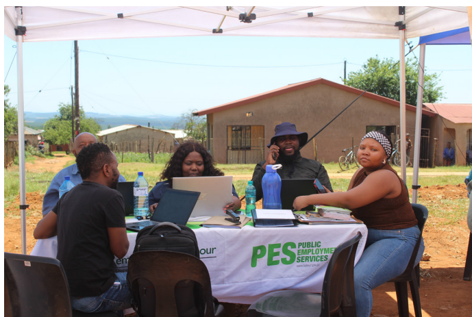
REPRESENTATIVES OF THE PUBLIC EMPLOYMENT SERVICES (PES) DEPARTMENT.