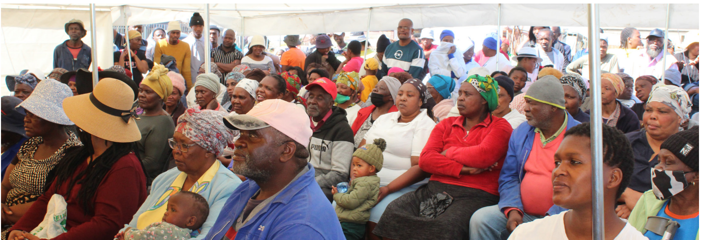
COMMUNITY MEMBERS PAYING ATTENTION TO THE MAYOR'S ADDRESSES