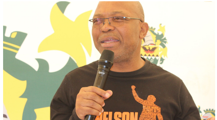
GERT SIBANDE DISTRICT MUNICIPALITY MAYOR, CLLR W MNGOMEZULU