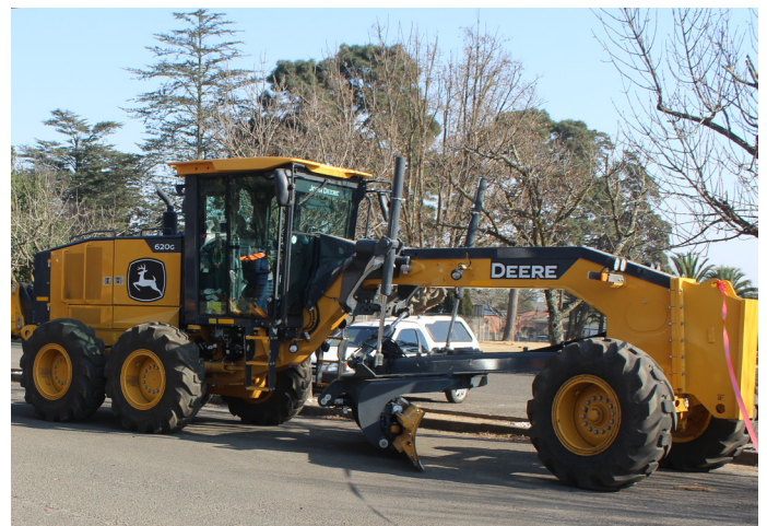
NEW GRINDER FOR THE MSUKALIGA LOCAL MUNICIPALITY FIELD/ONSITE WORKERS.