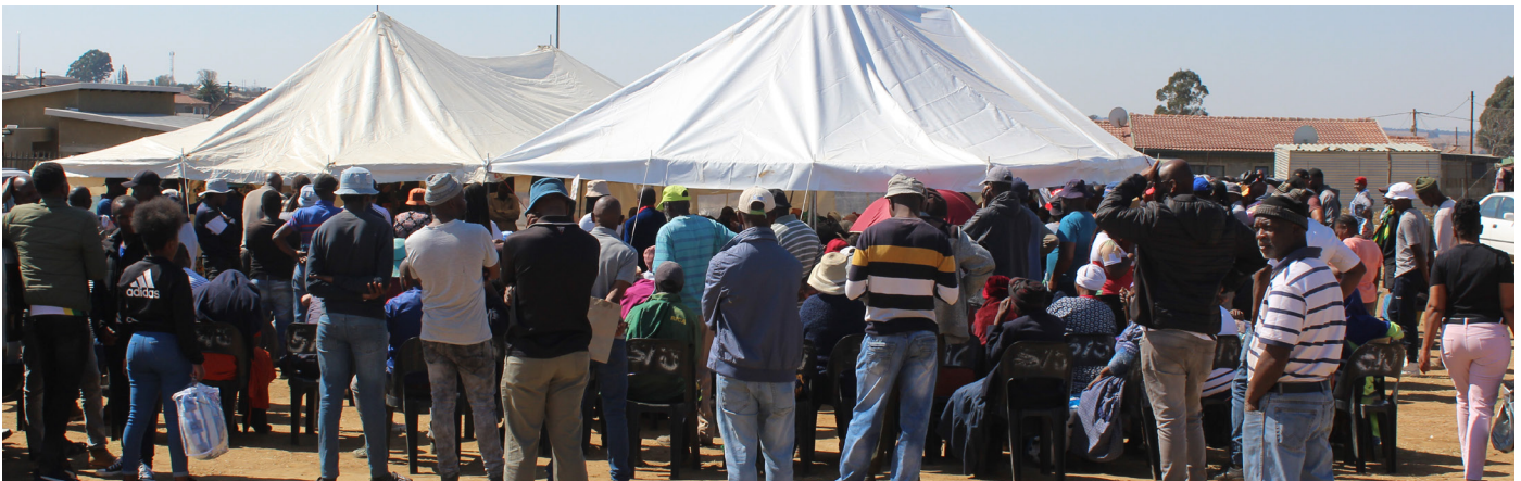
COMMUNITY MEMBERS CAME IN NUMBERS TO THE IMBIZO