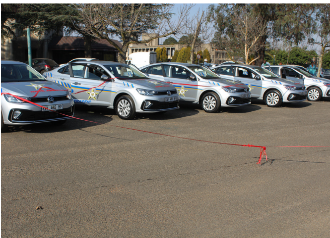
FIVE (5) MOTOR VEHICLES HANDED OVER BY EXECUTIVE MAYOR.